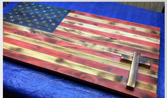
A custom flag made by Cootware Custom Woodworking